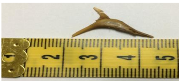
Figure 2. Fish bone after removal from the rectal wall

Decision was made to remove the foreign body per rectally under spinal anesthesia. The patient was placed in lithotomy position. After dilatation of the anal sphincter manually the piece of bone was identified and mobilized by finger and finally removed. There was some bleeding from the area of bone embedded. An anal gauze-pack was inserted after removal of the bone to prevent bleeding. A prophylactic Metronidazole was prescribed. The patient was admitted for observation overnight and discharged next day without residual problems.